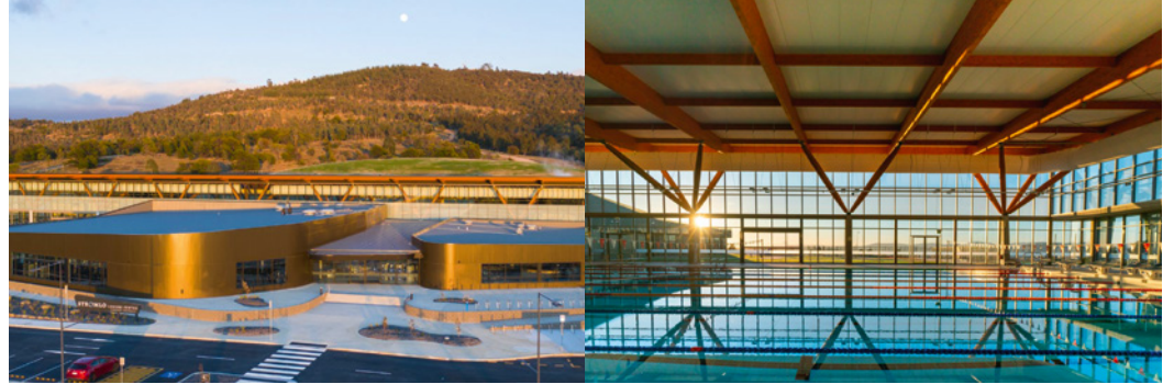
Cox Architecture