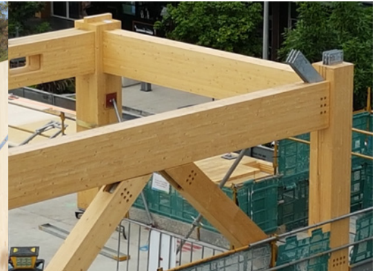
25 King Street / Bates Smart Architects