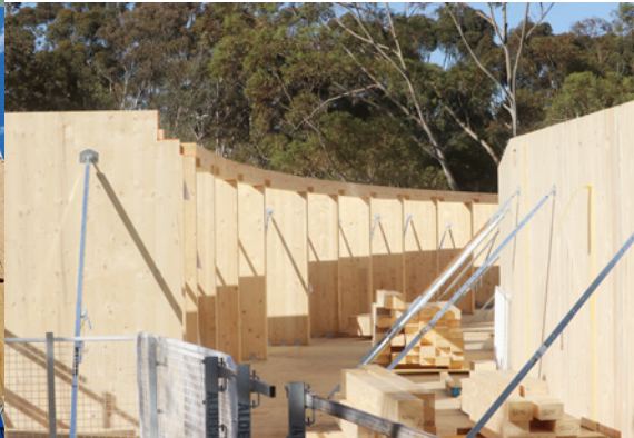
La Trobe University, JCB Architects