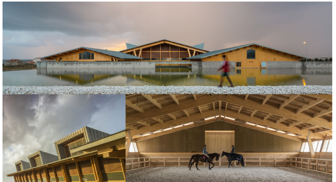
Architect: Carlos Castanheira, Images: Fernando Guerra FS+SG, Fotografias de Arquitectura