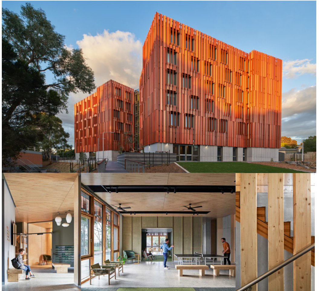
JCB Architects