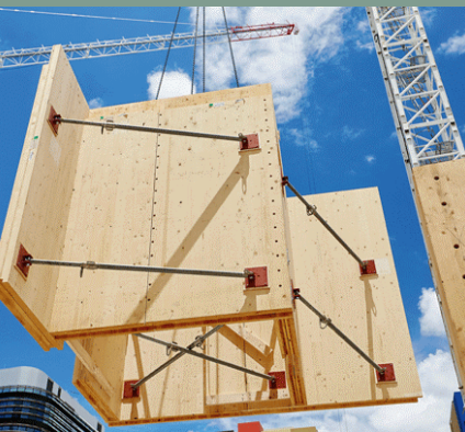
Daramu House / Tzannes Architects

> Dig into more facts about the safety and efficiency of building with timber here.