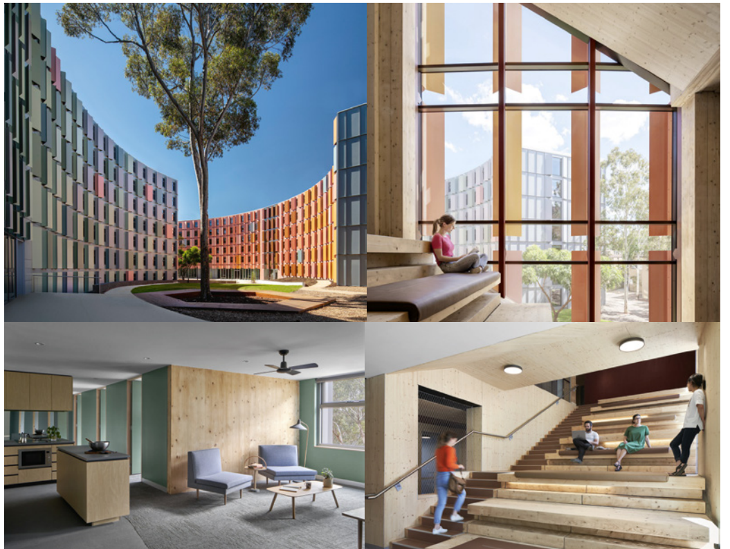
JCB Architects